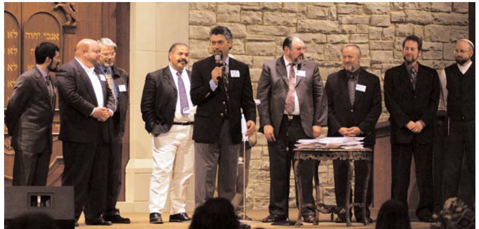
Messianic Leaders at the first TJCI II Banquet in Dallas

So, what is reconciliation? I have spent the last fifteen years of my life and ministry dedicated to the work of faith-based reconciliation in some of the world's roughest neighborhoods such as Kashmir, Sudan, Bosnia and Kosovo. Hence, I would like to weigh in on this complex subject. In individuals, reconciliation is a spirituality; a spirituality of transformation. In communities, reconciliation is a moral vision. As a spirituality, faith-based reconciliation is grounded in the doctrine of God's sovereignty, of surrender and submission to the