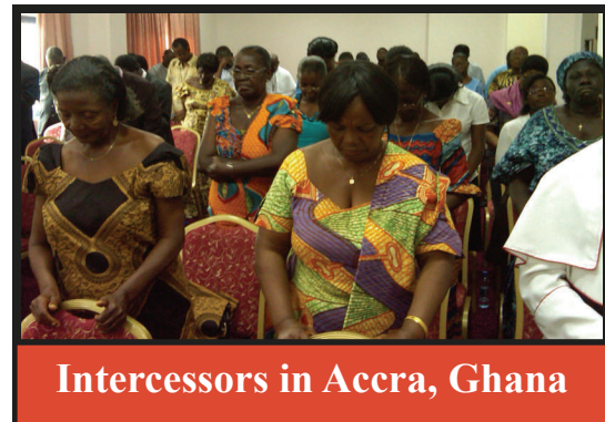
Intercessors in Accra, Ghana